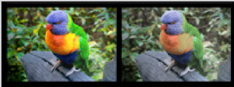
InFocus with DLP® BrilliantColor™ Technology